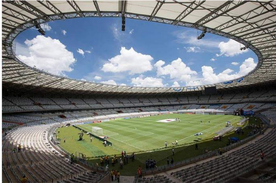
Mineirão (Soccer Stadium)