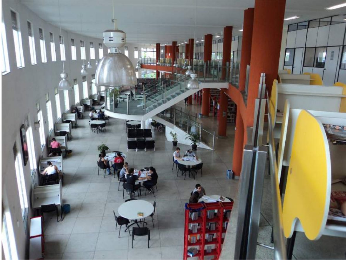
Library of the Campus I