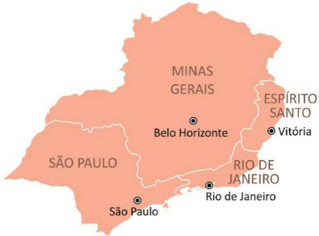
Southeast region of Brazil