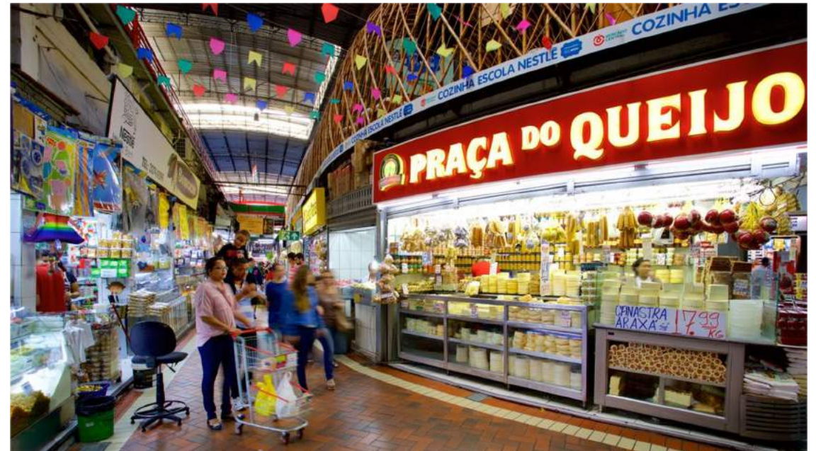
Mercado Central - Central Market