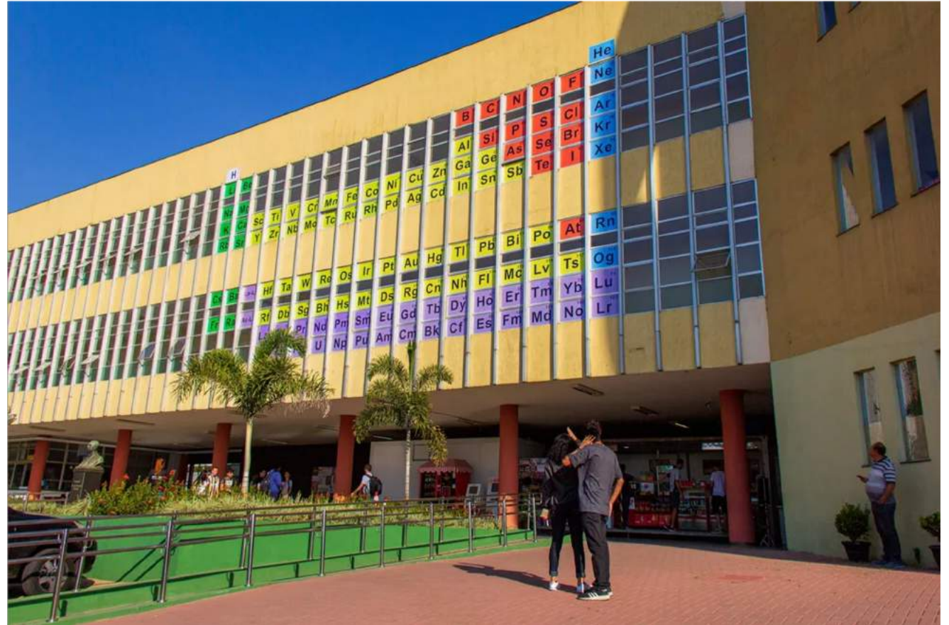
Chemistry Table Facade