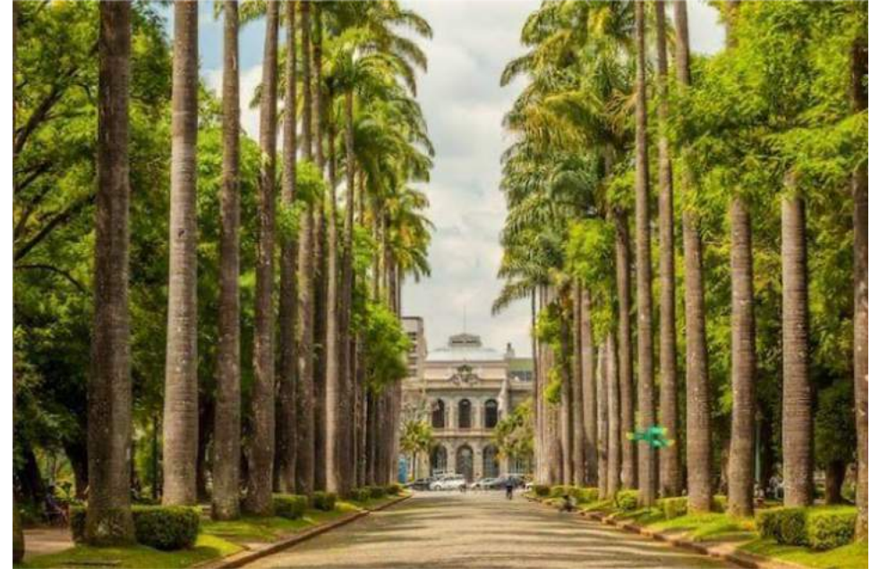
Praça da Liberdade - “Liberty Square”