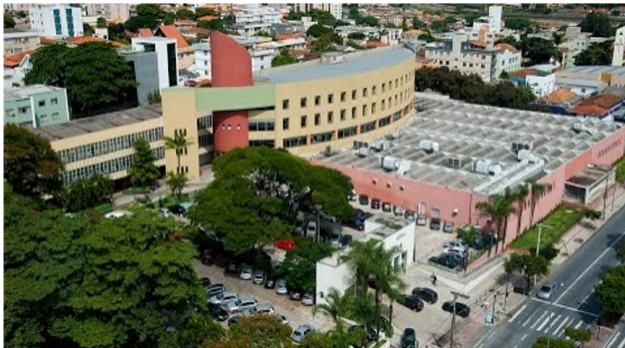
Campus I - CEFET-MG

The Federal Center for Technological Education of Minas Gerais has approximately 15,000 students and 650 teachers. It has a good reputation and a large number of departments and laboratories. It was founded in 1909 and has more than 10 campuses inside the Minas Gerais state.