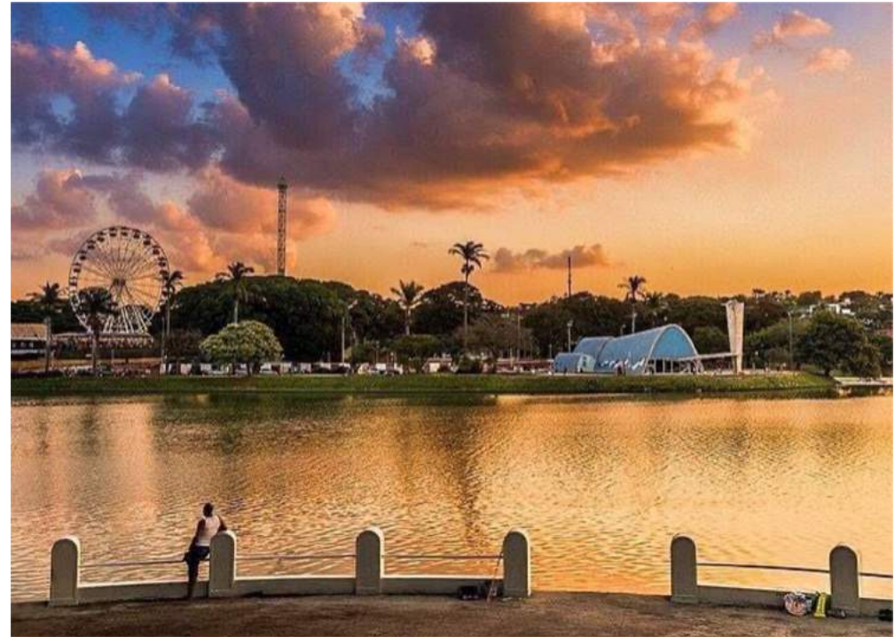
Belo Horizonte, Pampulha Lake