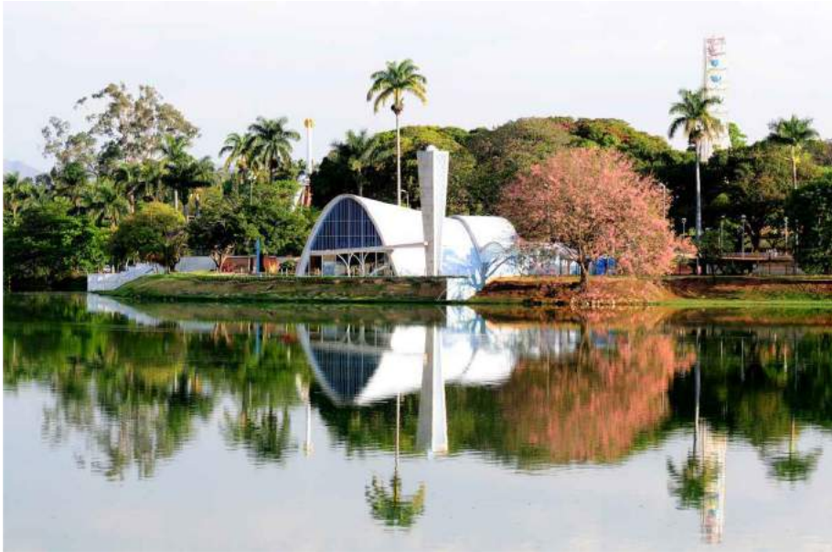
Church of São Francisco de Assis