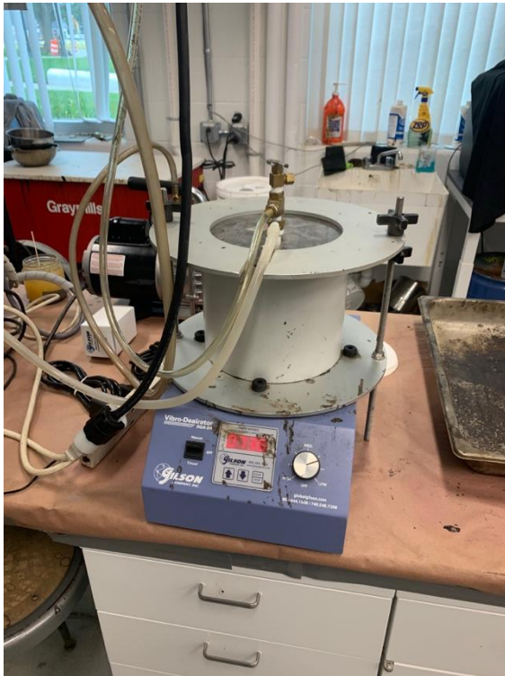
Figure 4: Vacuum Pump and Mechanical Agitator