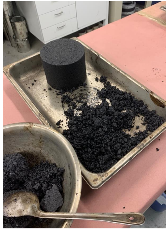
Figure 5: Specimen and loose sample